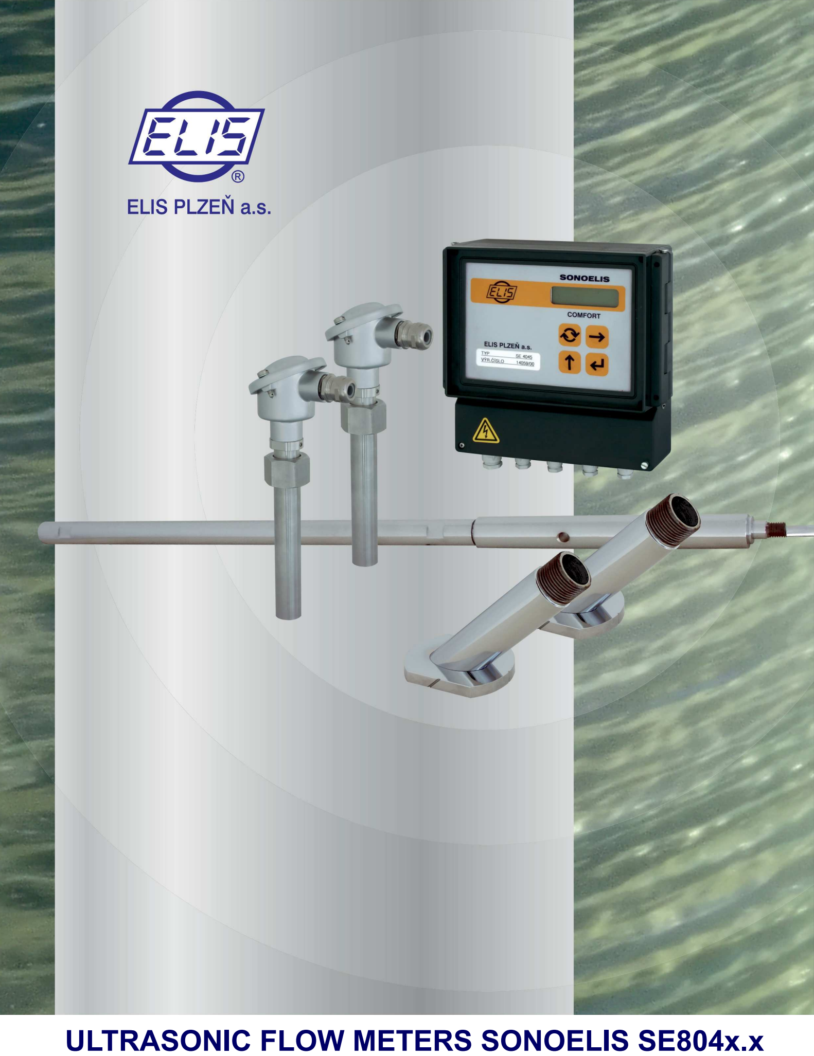
ULTRASONIC FLOW METERS SONOELIS SE804x.x SONOELIS SE806x.x